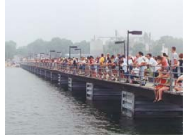
The Pier was packed for the Can-Am Cup

In between each Main Event Race, we will have 2 short Freestyle Shows