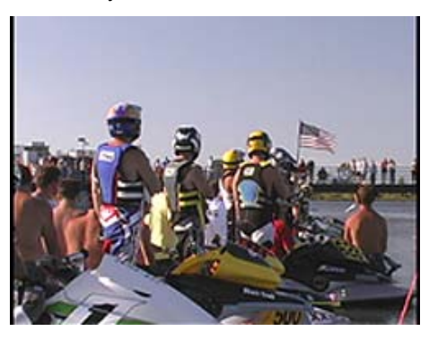
The National Anthem was played prior to the start of the 1200 Runabout Class

On Saturday, after the 1<sup>st</sup> set of Novice Moto's the Can-Am Cup Qualifiers were held. In the 1200 Runabout Class, there were 22