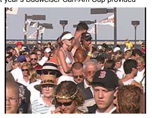
The Pier was packed with spectators for the Can-Am Cup

It wasn't because of the 6,500 screaming fans; it wasn't because of the 2003 Harbor Beach Maritime Festival ; it wasn't because this was Round 5 of the U.S. Grand National Watercross Championships ; it wasn't because they were competing for Nice Can-Am Cup Awards, and Payouts; it wasn't because this was a IJSBA World Championships Qualifier ; it wasn't because they were competing against some of the best riders from Canada; it WAS because they were competing for YOUR Country, that made this Event so Special. I can only describe this year's Budweiser Can-Am Cup as being the best Personal Watercraft Racing I've ever seen in 10 years of being associated with Personal Watercraft Racing.